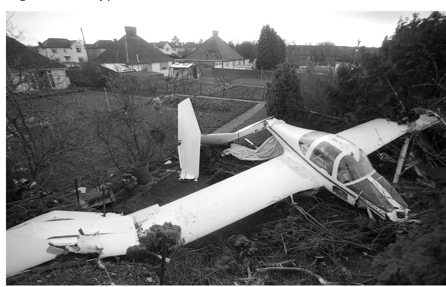
One of the damaged planes after high winds caused damage in 1990. Ref:132383-4