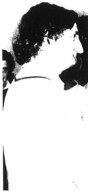
due to a heart attack was a sad loss.