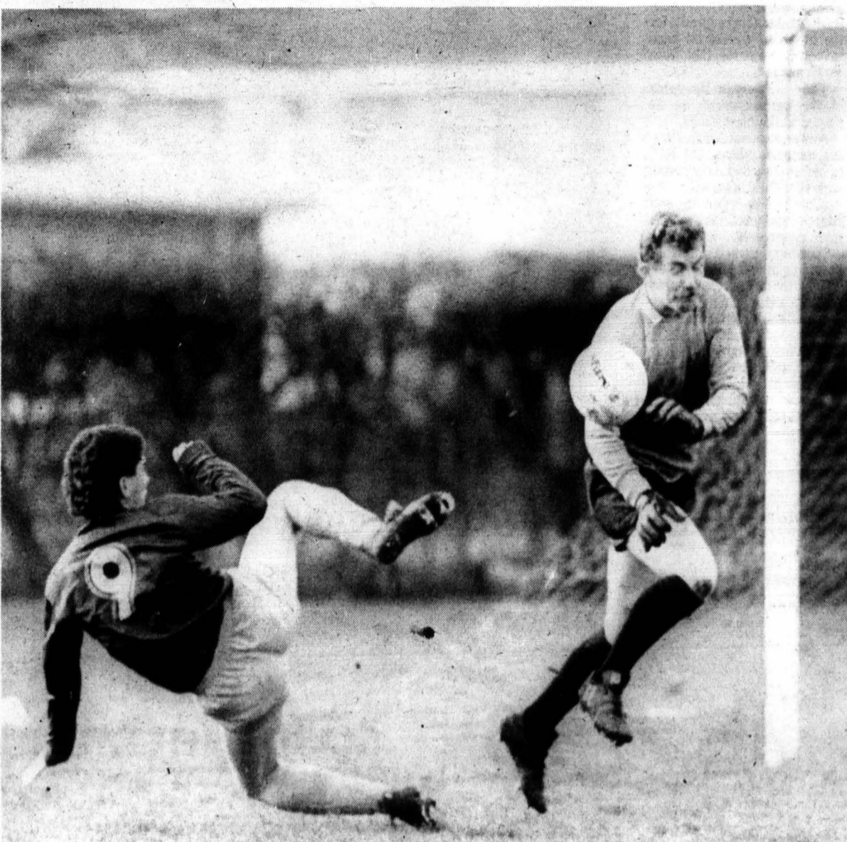
Old Paudians go for goal with the Anchor 'keeper stranded.